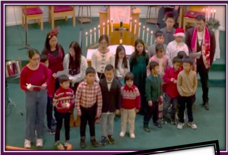
Canaan Kachin Worship Team